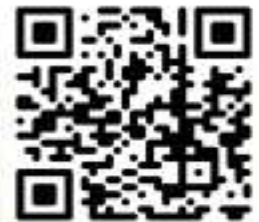
Documents required for Payment of Family Pension to Nok of Missing Personnel