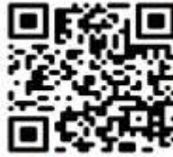
Submission of Life certificate through JEEVAN PRAMAAN App