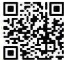
Documents required for Payment of Family Pension to Nok of Missing Personnel