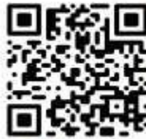
Submission of Life certificate through JEEVAN PRAMAAN App