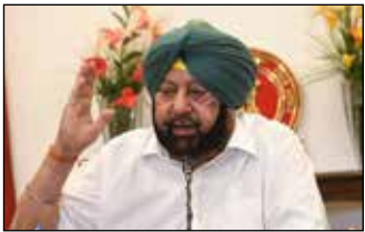
EXPRESS INDIA NEWS NETWORK CHANDIGARH, APRIL 4

Senior Bharatiya Janata Party leader and former Punjab Chief Minister Capt Amarinder Singh has demanded time bound compensation for the farmers whose wheat crop has been damaged by recent rains.