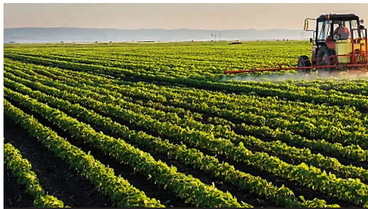
Food production (Million Metric Tons) Table-2

● India is the world's largest producer of milk, pulses and jute, and ranks as the second largest producer of rice, wheat, sugarcane, groundnut, vegetables, fruits and cotton. It is also one of the leading producers of spices, fish, poultry, live-stock and plantation crops.