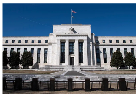
Headquarters of the US FED in Washington DC

Apart from the monetary policy of central banks, there are several other factors that can also impact inflation. One of the significant factors is the government's fiscal deficit. When the government spends more money than it earns, it has to borrow money from the central bank or from the open market,