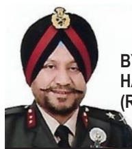
BY MAJ GEN HARVIJAY SINGH (RETD, SM)

L ate in Aug 2020, a provocative military movement by the People's Liberation Army (PLA) was blocked by Indian Army troops who moved in quickly to occupy dominating heights on the South Bank of Pangong Tso. This was a consequence of effective Intelligence, Surveillance and Reconnaissance inputs indicating that PLA was attempting to move in to occupy the same area.