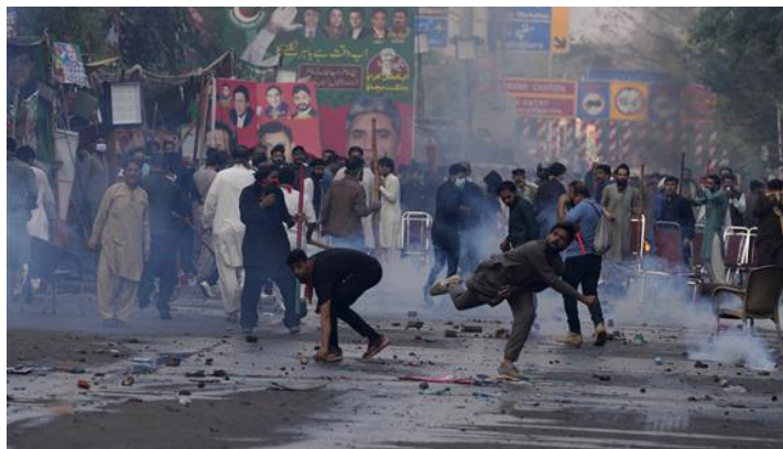
Supporters of ex-Pak PM Imran Khan throw stones during clashes with police in Lahore on Tuesday.

Soon after his speech, protests broke out in Islamabad, Peshawar, Karachi, Faisalabad, Sargodha, Vehari, Peshawar, Quetta, and Mianwali. Khan has been in the crosshairs for buying gifts, including an expensive Graff wristwatch he had received as the premier at a discounted price from the state depository called Toshakhana and selling them for profit.