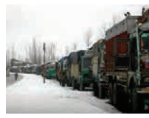
The 260-kilometre-long highway was blocked due to snow, landslides and shooting stones caused by heavy snowfall since Sunday.

No new traffic was, however, allowed on the highway, the only all-weather road connecting Kashmir with the rest of the country, even though there was improvement in weather conditions across the Valley, they said. "Stranded traffic has been allowed to move after the highway was cleared for the movement of traffic this morning," an official of the Traffic control room said.