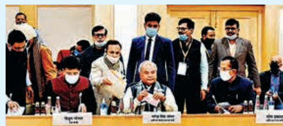
Union Minister for Agriculture Narendra Singh Tomar during the 8th round of talks with farmers representatives at Vigyan Bhawan in New Delhi, on Friday.

Agriculture Minister Narendra Singh Tomar virtually ruled out repeal of the laws saying many other groups across the country are supporting these reforms. On whether the government made a proposal to farmers to join a pending case in Supreme Court on issues related to farmers' protest, Tomar said the government did not make any such suggestion but it is always committed to follow whatever is decided by the Supreme Court.