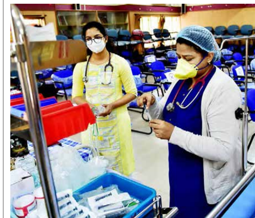
A health worker prepares for the dry run of COVID-19 vaccine at a civil hospital, in Bengaluru on Friday.