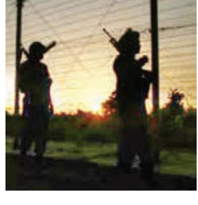
A minor, who had inadvertently crossed the Line of Control (LoC) from Pakistan occupied Kashmir (PoK) to Poonch district in Jammu and Kashmir, has been repatriated, the army said on Friday.