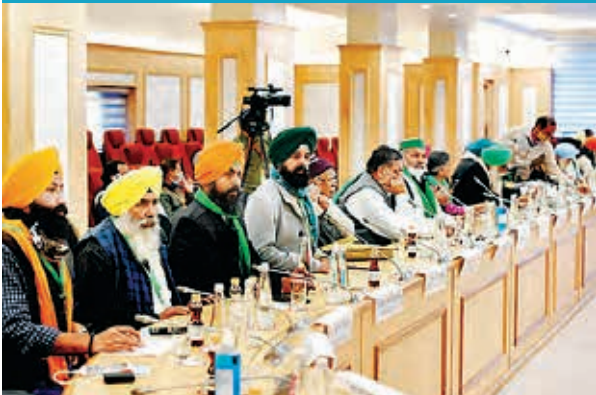
Farmers representatives during the 8th round of talks with the government over the new farm laws, at Vigyan Bhawan in New Delhi, on Friday.

Agriculture Minister Narendra Singh Tomar virtually ruled out repeal of the laws saying many other groups across the country are supporting these reforms. On whether the government made a proposal to farmers to join a pending case in Supreme Court on issues related to farmers' protest, Tomar said the government did not make any such suggestion but it is always committed to follow whatever is decided by the Supreme Court.