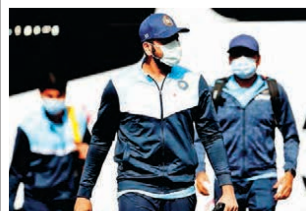
BRISBANE, JANUARY 8

A fresh three-day lockdown in Brisbane has put Cricket Australia in a spot of bother as it makes desperate efforts to hold the fourth and final Test against India in the Queensland state capital from January 15.