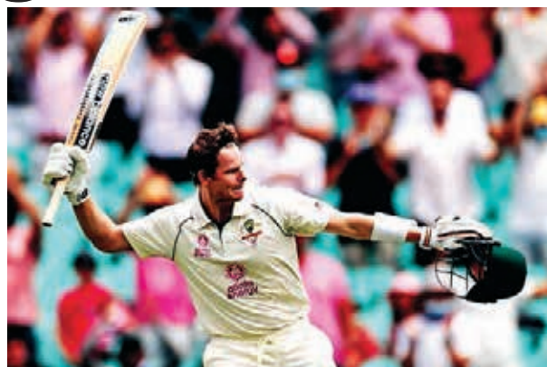
his maiden half-century.

Josh Hazlewood celebrated his 30th birthday by ending Rohit Sharma's first innings of the series caught and bowled for 26 before Pat Cummins had Shubman Gill caught at gully just after the young opener had reached