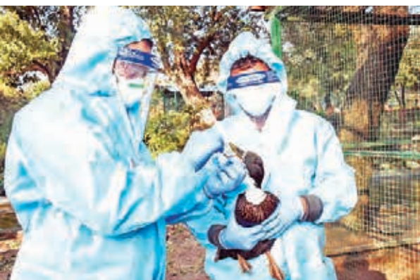
Centre on Friday said bird flu has been confirmed so far in Kerala, Rajasthan, Madhya Pradesh, Himachal Pradesh, Haryana and Gujarat, and asked these six states to contain the disease as per the action plan

PUNJAB EXPRESS BUREAU Chandigarh/New Delhi January 8