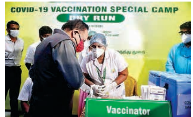
Union Health Minister Harsh Vardhan reviews the dry run for administering COVID-19 vaccine, in Chennai, on Friday.

Prime Minister Narendra Modi will interact with chief ministers of all states on January 11 to discuss the COVID-19 situation and the vaccination roll-out in the country, his office said on Friday. This will be Modi's first interaction with chief ministers following the recent approval of two coronavirus vaccines for restricted emergency use by India's drug regulator. The Prime Minister has often spoken with state chief ministers following the pandemic's outbreak in the country. India is preparing for the roll-out of COVID-19 vaccines and the second nationwide mock drill on the drive was conducted on Friday.