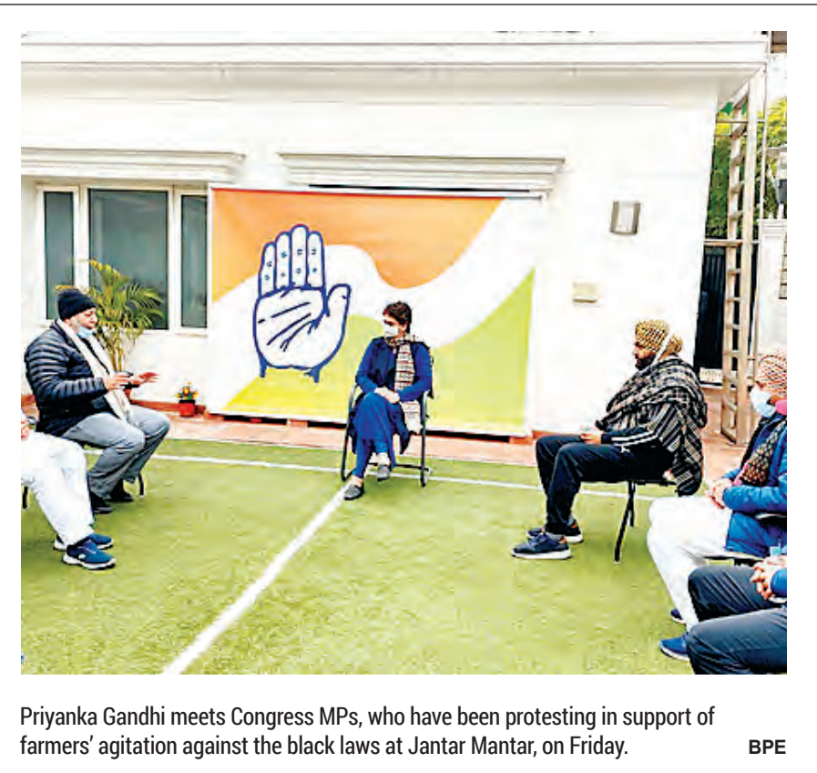
Priyanka Gandhi meets Congress MPs, who have been protesting in support of farmers' agitation against the black laws at Jantar Mantar, on Friday.

The spokesperson also said that the channels off-taking from Upper Bari Doab Canal i.e. Kasur Branch Lower with its distributaries being in the first preference will run to their indent and balance water supplies available will be utilized in Sabhraon Branch, Lahore Branch with their distributaries and Main Branch Lower respectively.