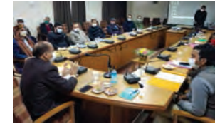
PUNJAB EXPRESS BUREAU Shimla, January 8

Himachal Pradesh Chief Minister Jai Ram Thakur said on Friday that authorities were monitoring the migratory birds at the Pong Dam and adjoining areas and set up quick reaction teams to contain bird flu. Thakur said that 65 teams of the Animal Husbandry and the Wildlife Departments were regularly monitoring the situation. Presiding over a review meeting here on the ways to control avian influenza reported in the Pong wetlands this week, he said that 3,410 migratory birds have so far died of the flu. 90 per cent of the dead birds were endangered bar-headed geese.