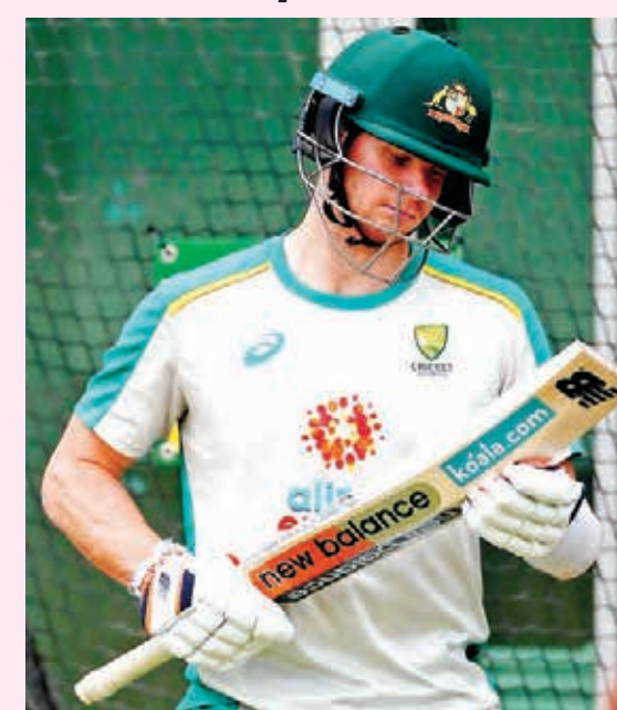
SYDNEY, JANUARY 8

Australia 'would like to play' the fourth and final Test against India in Brisbane, batting mainstay Steve Smith said, on Friday, even as Queensland entered into a three-day coronavirus-enforced lockdown casting fresh doubts on the fate of the match.