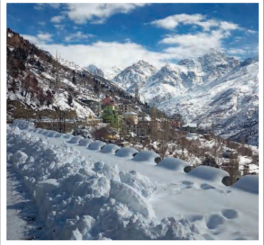
View of the snow covered area after the town received fresh snowfall, at Keylong in Lahaul-Spiti District, on Friday.