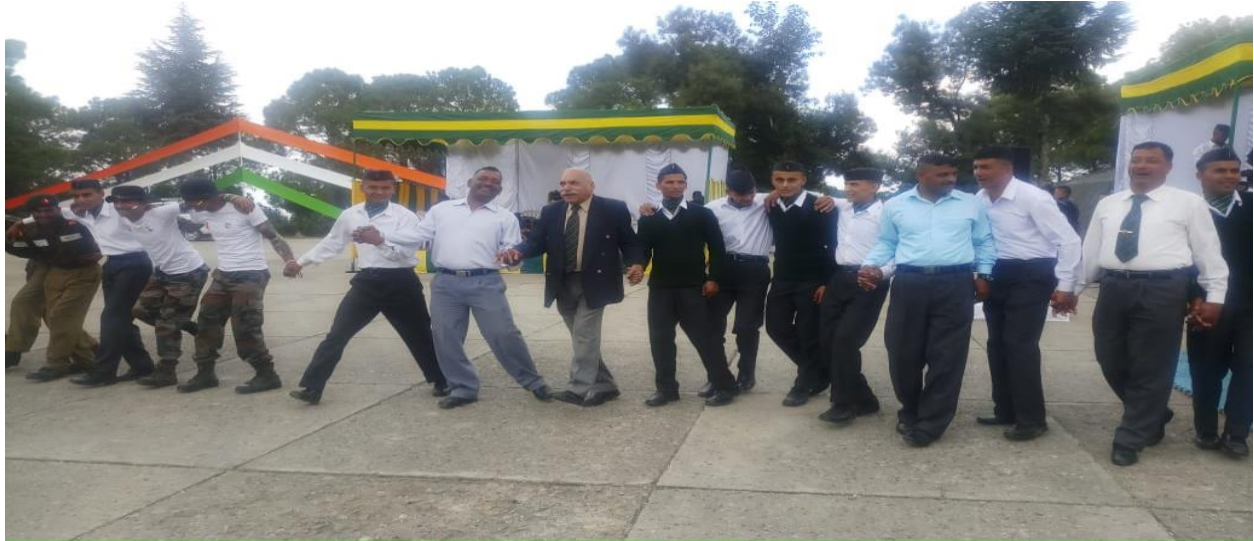
Dancing on Bedu Pako Bara Massa; while recruits are in steps most of us are not after few drinks!!