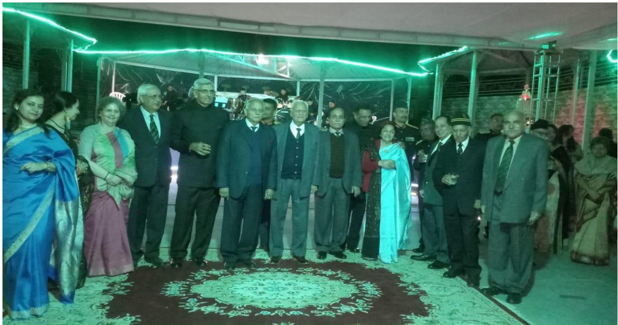
Beraris- the Oldest link to the Kumaon Regiment who believe in the motto 'Once a Berari is always a Berari'