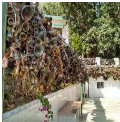
Jhula Devi Mandir