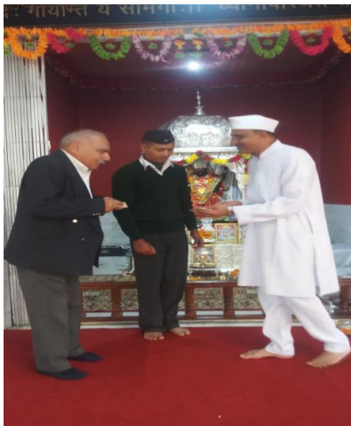
Regimental Mankameshwar Mandir