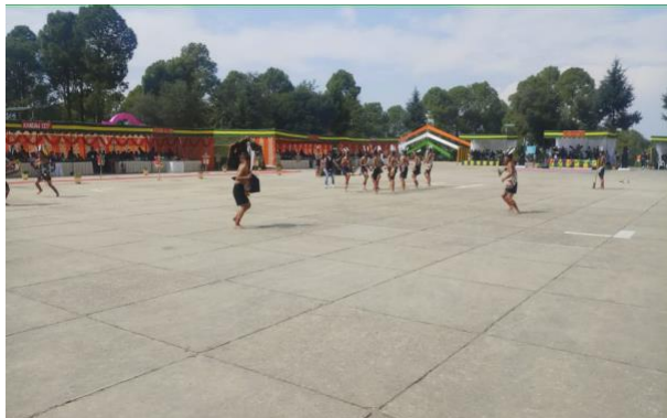
Naga dance by Naga recruits in Barakhana is always a BIG attraction!