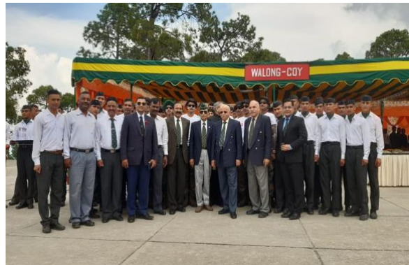
Recruits and staff of 6 Kumaon's Walong Company in Barakhana