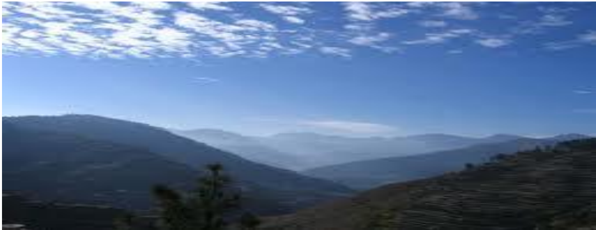
Panoramic view from Ranikhet

giving it the name, Ranikhet which was first established as a cantonment town by the British Raj in 1869 and is the only cantonment in India to enjoy heritage status. The vestiges of the colonial era are still clearly apparent in this neat and tidy cantonment with various heritage hotels from that period and old churches, including a couple that are no longer in service but have been rightly converted into tweed and shawl factories by the KRC and run by the Veer Naris and ex-servicemen's families.