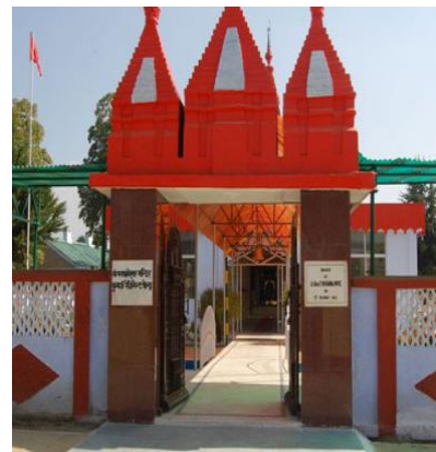
Regimental Mankameshwar Mandir