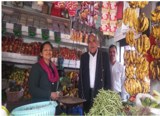
Uma the computer