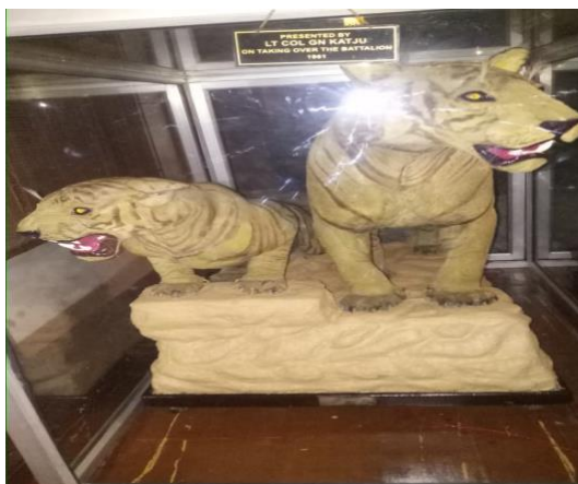
Man eaters of Kumaon caged in KRC Officers' Mess