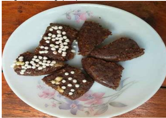
Baal Mithai both versions