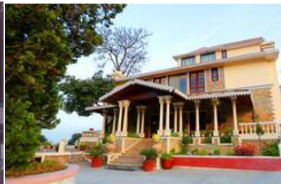
Welcome Heritage Windsor Lodge, Ranikhet