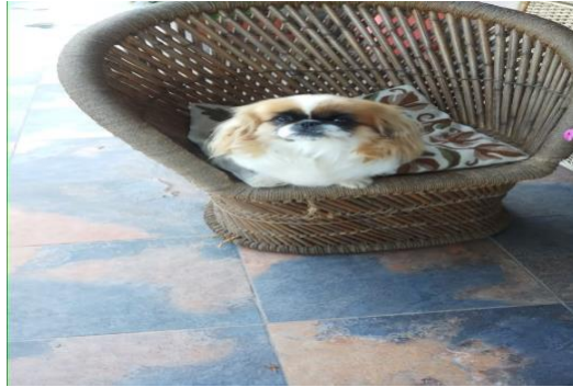
This one is just one of the 14 beauties

During Reunion dinner the previous evening, Brig and Jasbir dwelled on me for morning breakfast at their beautiful 'Valley View Villa' across Majkhali. They sent their car to pick me up and I had quick sumptuous breakfast and yearning chat before saying 'au revoir' to Brig & Mrs Jasbir Singh and their unbelievable 14 beautiful pooches!