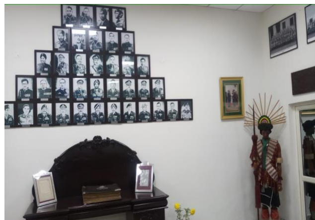
The KRC Tigers & the Visitors' Book